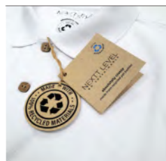
BRANDED HANG TAGS