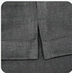
Side slits on bottom