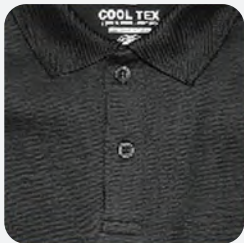
Premium Quality 2-Buttons Box Placket