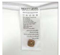
CARE LABEL WITH EXTRA BUTTON